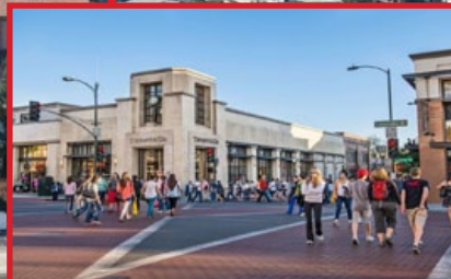
OLD TOWN PASADENA