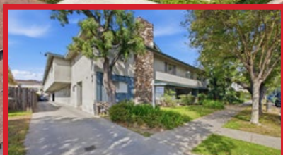
411 N CHAPEL AVE