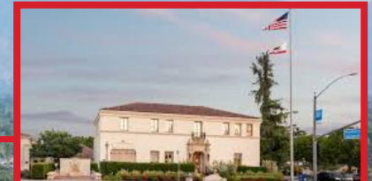
CITY OF SAN MARINO