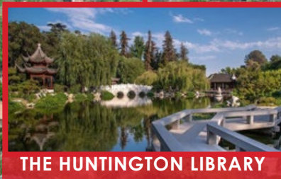
THE HUNTINGTON LIBRARY