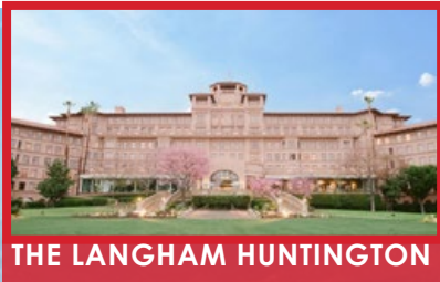
THE LANGHAM HUNTINGTON