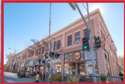
CITY OF SOUTH PASADENA