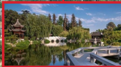
THE HUNTINGTON LIBRARY