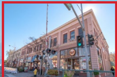
CITY OF SOUTH PASADENA