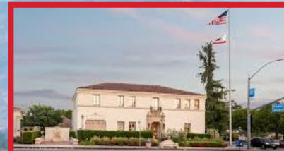
CITY OF SAN MARINO